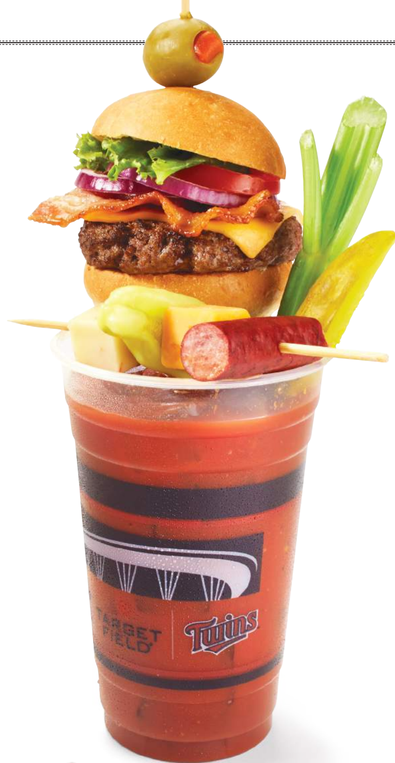
7 BIGGER BETTER BURGER BLOODY MARY