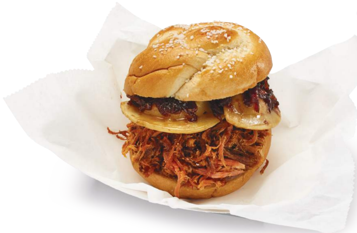
8 PULLED PORK PIEROGI STACKER

MAURO, FIERI AND MORIMOTO: AP PHOTO; YEARWOOD: GETTY IMAGES.